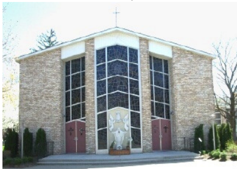
Infant Saviour, Pine Bush